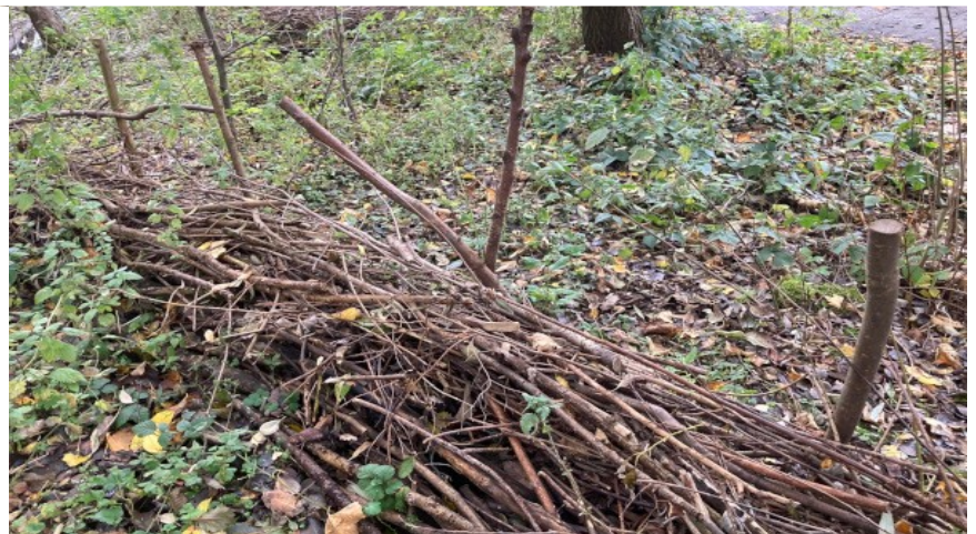
Snowberry cuttings on the tarpaulin, and using them for the 'dead hedge' to help stop the bank eroding