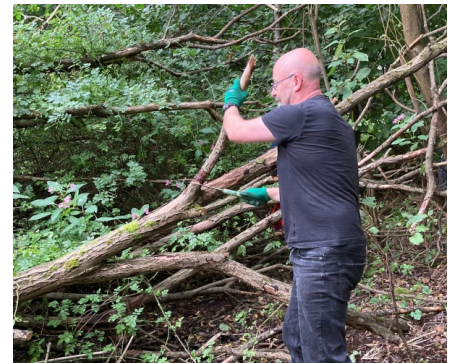
Cutting the willow back