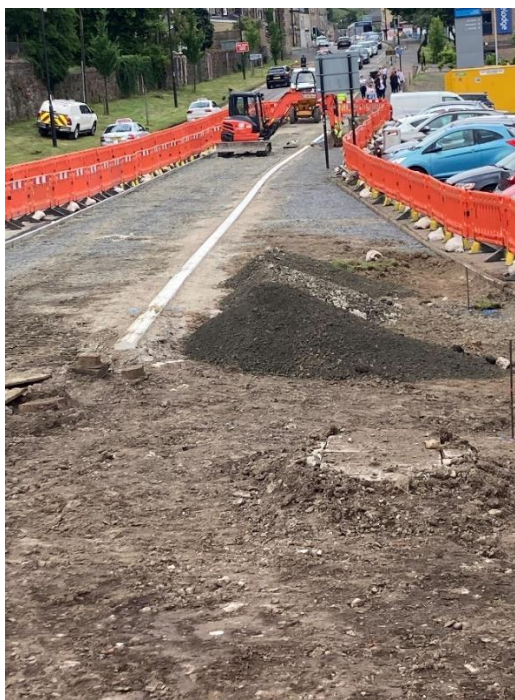
Goosecroft Road, 30/06/22

The next sections of the route to start construction are Dumbarton Road and Causewayhead Road. To keep up to date with the construction schedule, go to the website where all updates will be posted.