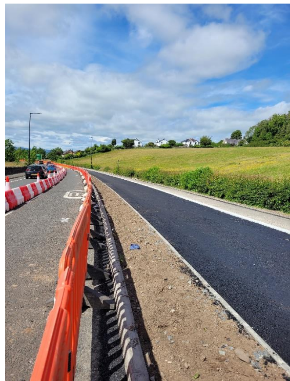
Raploch Road, 22/06/22

The Goosecroft Road section is progressing well. Being right in the city centre it will increase the visibility of cyclists significantly, helping to normalise cycling as a healthy, sustainable, efficient mode of transport.